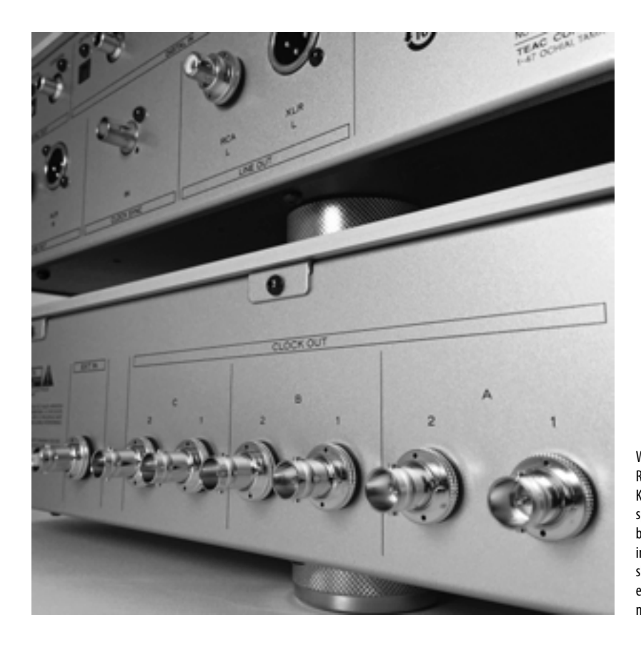
When playing the Sonny Rollins' classic "Oelo", the K-05X produces a wonderfully springy yet well-controlled bass. With flawless engineering and superb workmanship, it raises the "music experience" to a spectacular

ABSOLUTE FIDELITY | EQUIPMENT - DIGITAL SACD-PLAYER / MASTER CLOCK GENERATOR